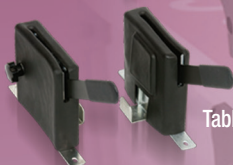
Table Mount Elevators