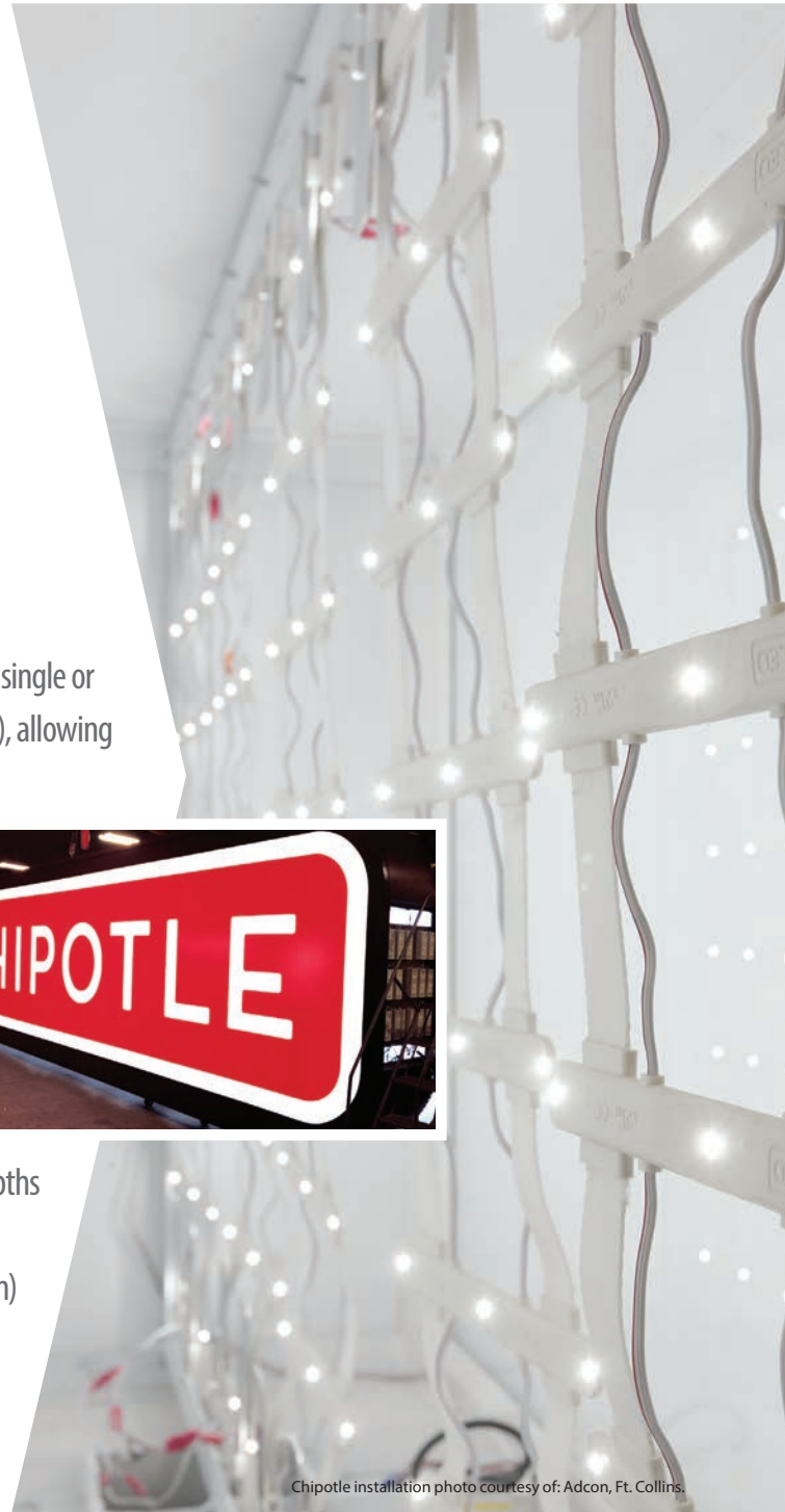
Chipotle installation

Other LED manufacturers use cheaper components and maximize the potential brightness of their products at the expense of longevity; overdriving the LEDs for instant gratification while sacrificing sustainability and endurance. SloanLED uses the highest caliber components in order to offer you a superior product with the longest lifespan.