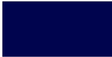
1505 Dark Blue