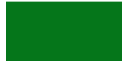
1655 Bright Green