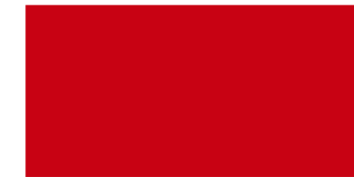
1602 Deep Red