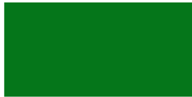
1555 Bright Green