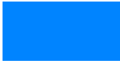
1522 Light Blue