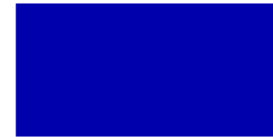
1625 Reflex Blue