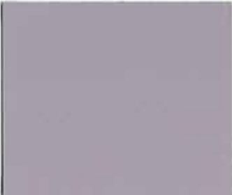
815 Road Grey