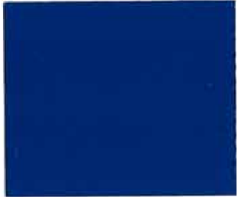
548 Deep Blue *