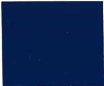
566 Cobalt Blue