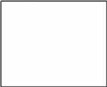
1F4 Traffic White