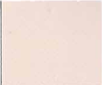
251 Oyster White *